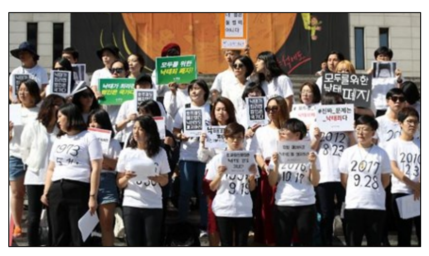
Photo: Demonstration for abortion rights, South Korea, 28 September 2017

The World Health Organization (WHO) and the Guttmacher Institute jointly published a set of infographics to mark 28 September, which we disseminated. The media internationally picked up on and covered all of these extensively.