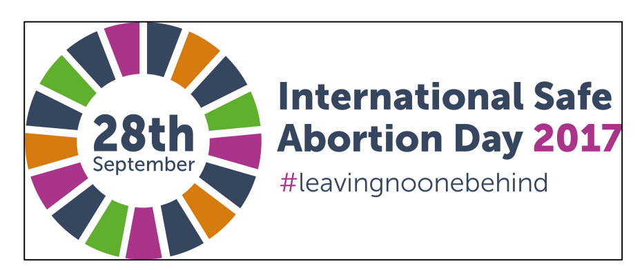
Campaign logo for International Safe Abortion day 2017 by Laura Malan.