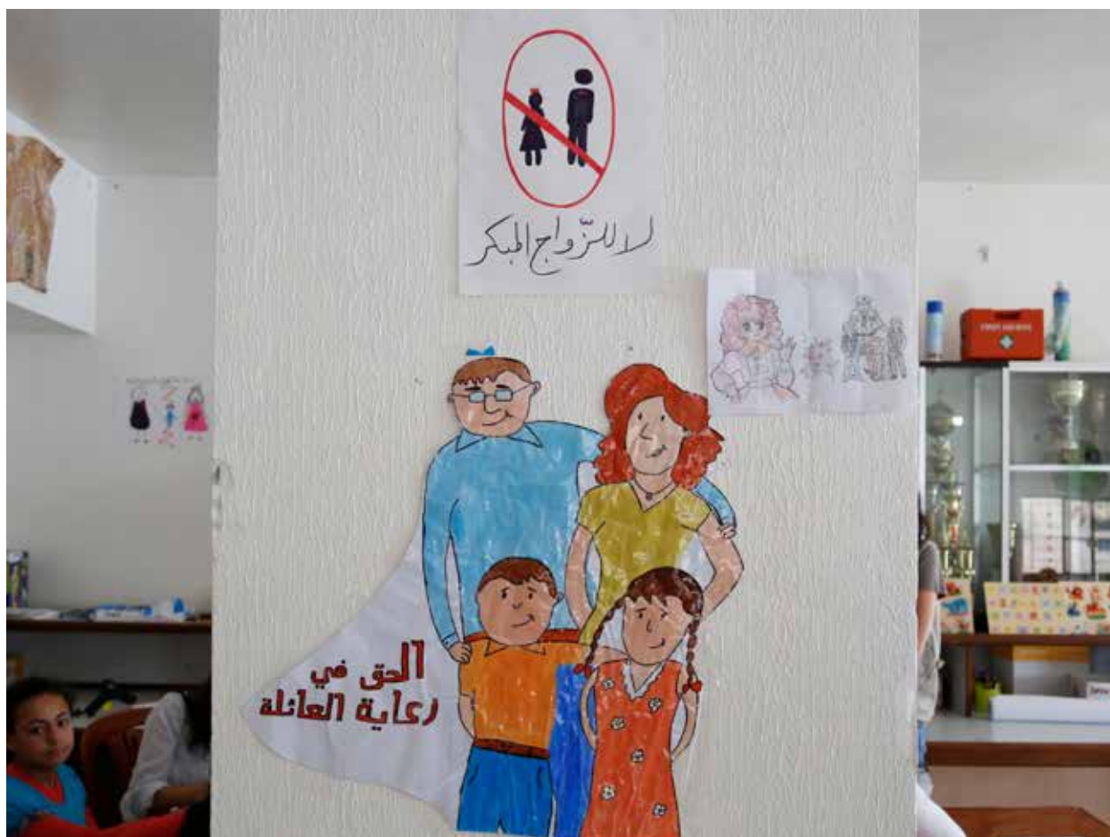
Drawings by young Syrian refugee girls in a community center in southern Lebanon promote the prevention of child marriage.