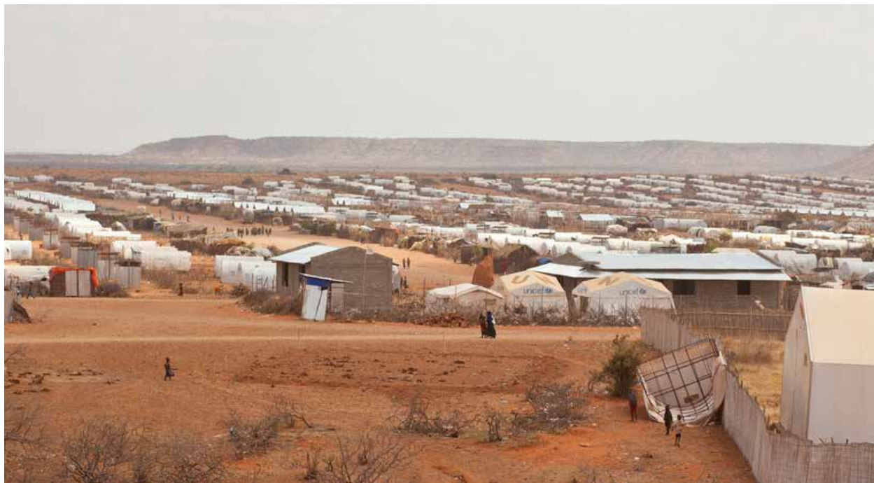
The Kobe refugee camp in Dolo Ado, Ethiopia is home to 40,000 refugees from Somalia.