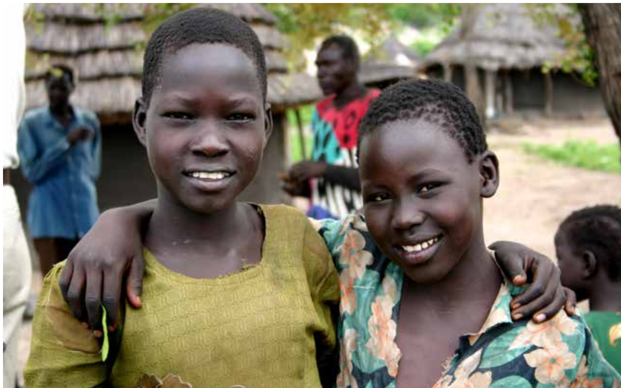
Displaced Ugandan girls.