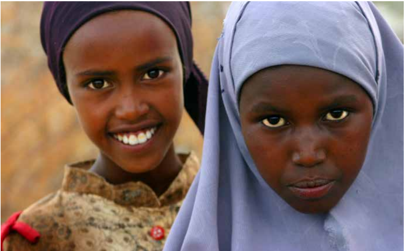
“Sunny and Serious Awbare Girls,” Somali girls in Ethiopia