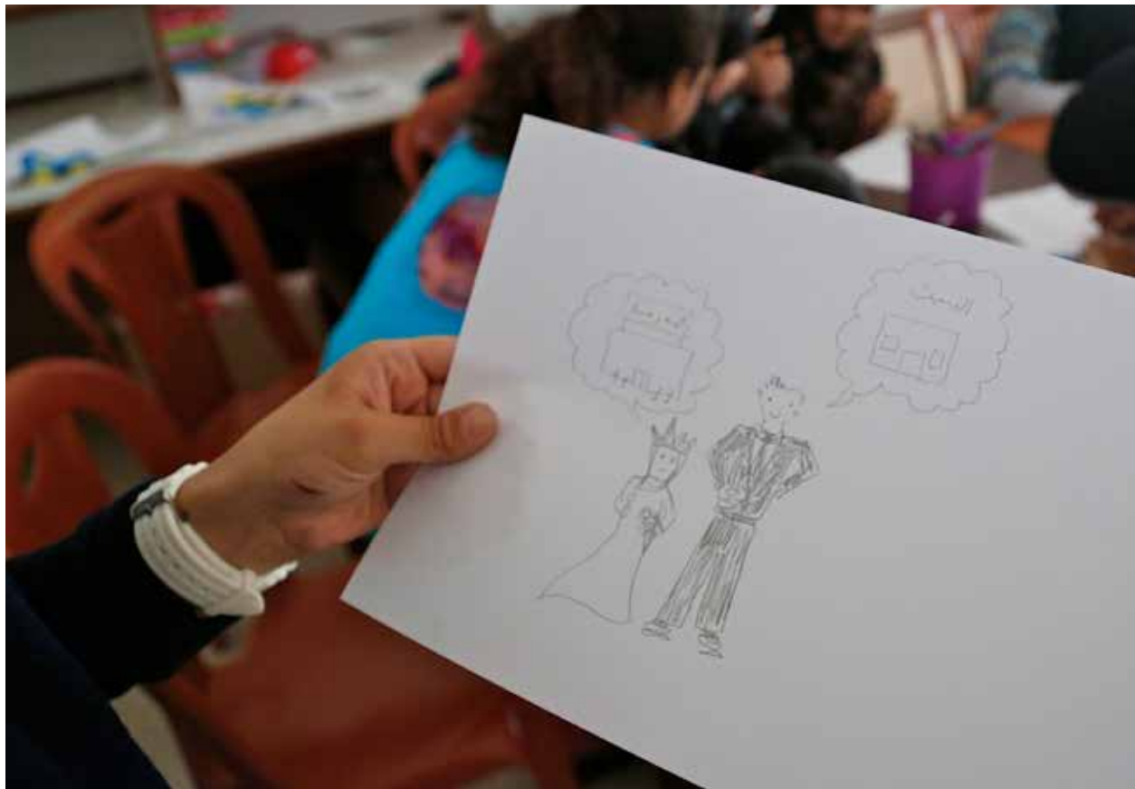
A girl holds up a drawing of a bride and groom during a discussion about child marriage with teenage Syrian refugee girls in a community center in southern Lebanon.

Evaluation research has identified promising interventions, but research is lacking on how these can be integrated within emergency response. In humanitarian contexts, approaches to preventing and responding to child marriage should be piloted and specifically monitored for child marriage outcomes, including: skills and asset building of adolescent girls; parent and community education; economic interventions for household self-reliance; improving access to education; and outreach strategies to married girls inclusive of comprehensive health and livelihoods programming. Multi-sector approaches to address child marriage, as a form of GBV, could also be piloted during the roll-out of the IASC GBV Guidelines.