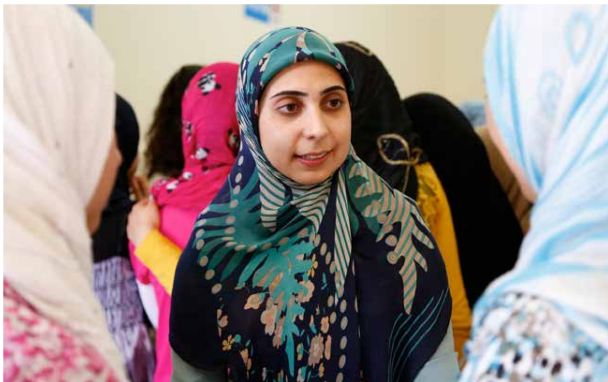
A Lebanese teacher talks to two Syrian refugee girls at an information session about gender-based violence and early marriage in southern Lebanon.

Young girls expressed a strong desire to stay in school, and saw child marriage as